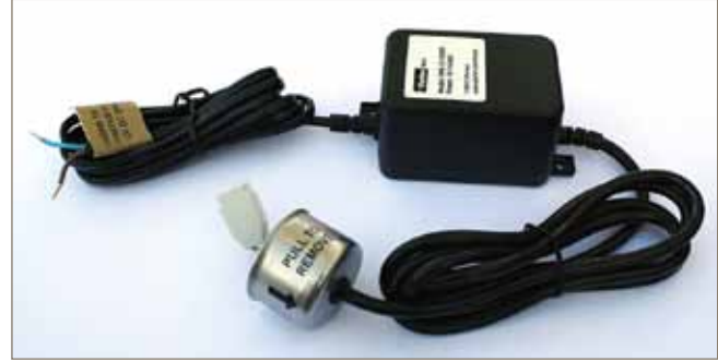
12 Volt Ballast & Lamp Socket

Three different power supply options are available. All units have an external indicator to confirm that the lamp is operational.