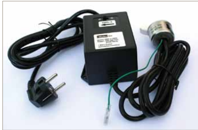
220 Volt Ballast & Lamp Socket