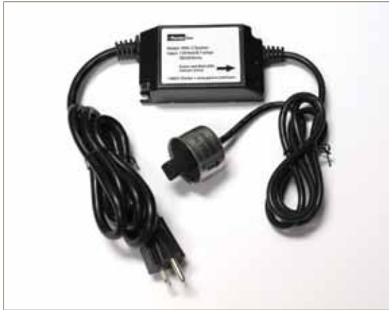
120 Volt Ballast & Lamp Socket